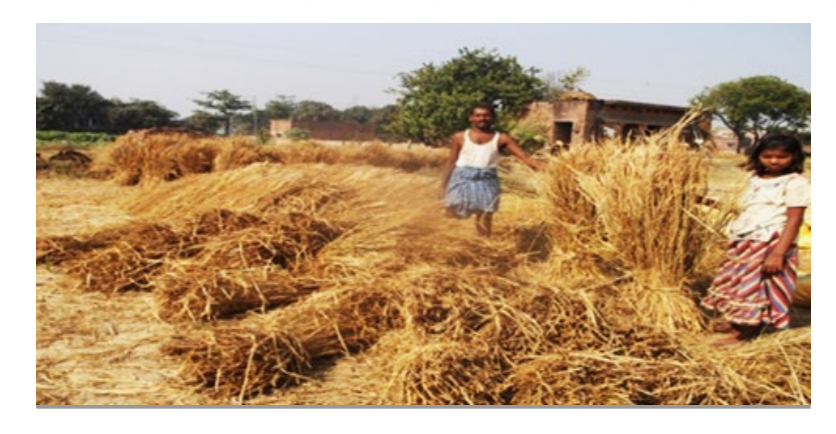
Agriculture waste material